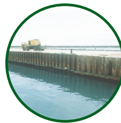
Structural Wall Maintenance