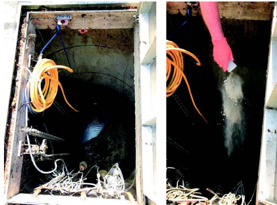
Application in manhole/lift station

Recommended treatment: 1 lb. per week per lift station to start; adjust concentrations and quantities to match level of FOG in the lift station.